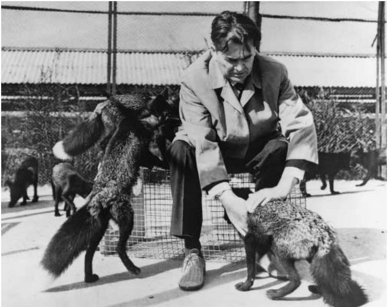
Figure 1. In the late 1950s, the Russian geneticist Dmitry K. Belyaev began a decades-long effort to breed a population of tame foxes. Belyaev, then director of the Institute of Cytology and Genetics of the U.S.S.R. (now Russian) Academy of Sciences in Novosibirsk, Siberia, hoped to show that physical and morphological changes in domestic animals such as dogs could have resulted from selection for a single behavioral trait, friendliness toward people. Fourteen years after his death, the experiment continues, and the results appear to support Belyaev's hypothesis.

that might well explain why different animals would respond in similar ways when subjected to the same kinds of selective pressures.